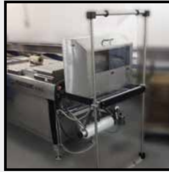
MLP printing on bottom web