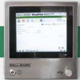
Advanced, IP-67 rated, 10.4" (264 mm) HMI