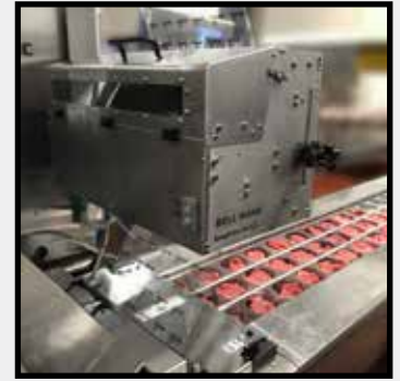
Mounted on a HFFS food packaging line