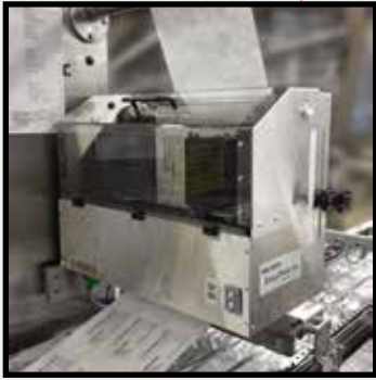
Mounted on a HFFS medical device packaging line